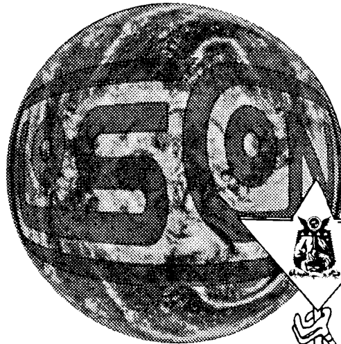
SPACE STATION 2K2